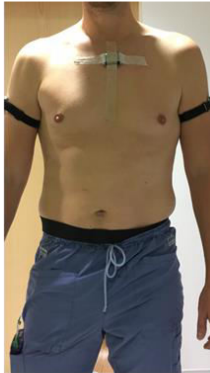
Figure 2. Wearable wireless motion tracking sensors placed on the surgeon before the surgery. Head's sensor is not depicted in this photo.