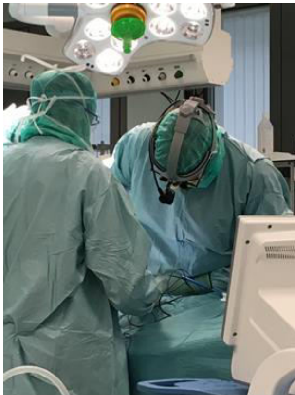
Figure 1. Surgeon during operation with his back and neck bended and his arms in abduction.

Several professionals such as surgeons are at risk of these symptoms. The surgeons perform the surgery in a standing position, and the hands are generally in motion in surgery. Sometimes a fixed posture continues for hours and the pressure exerted by the musculoskeletal organs is too high. Over time, the continuous exposure to biomechanical and psychological stressors may intensify the musculoskeletal injuries in the workplace. Nowadays, various surgical procedures are done such as open surgery. The body posture of the surgeons during open surgeries is described as a head-bent and back-bent posture. Surgeons maintain this posture for long periods, and as a result, they experience physical discomfort during and after the surgery. Due to the position and depth of the incision during open surgery, surgeons have a fixed work posture, tending to work with arms abducted and unsupported. In addition to improper posture due to ergonomics, repetitive movements of the hands and wrists, neck and shoulders, and excessive force can ultimately cause or exacerbate musculoskeletal disorders.